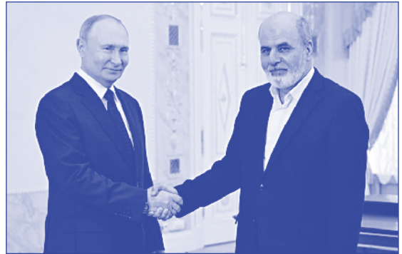
Russia's President Vladimir Putin and Iran's Supreme National Security Council Secretary Ali Akbar Ahmadian during a meeting in Russia in September 2024

Later, al-Qaeda became the breeding ground for ISIS, which threatened the annihilation of Israel and “the West,” especially the U.S. Since then, another dark force — the Islamic Republic of Iran — has been amassing power in the Middle East and threatening both Israel and the U.S. Joined by its proxies — Hamas in Gaza, Hezbollah in Lebanon, Iraqi and Syrian militia, and the Houthis in Yemen — this new axis of evil vows to eliminate Israel as their first step to dominating “the West.”