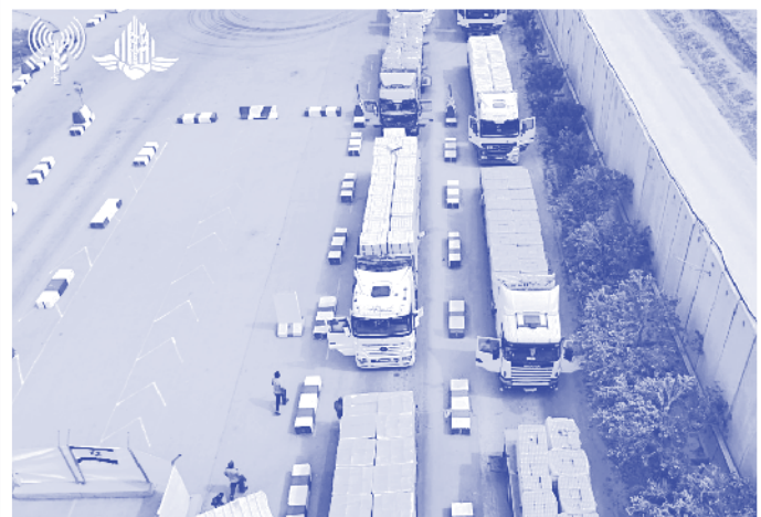
Trucks from Israel delivering humanitarian aid to Gaza

Beyond staying alive, Hamas seeks to eradicate Israel. They don't care about the tremendous suffering of civilians in Gaza. Hamas leaders hope for a regional war that would remove IDF forces from Gaza. An expanded conflict would allow the terrorist organization to regroup and prepare for another massacre against Israelis.